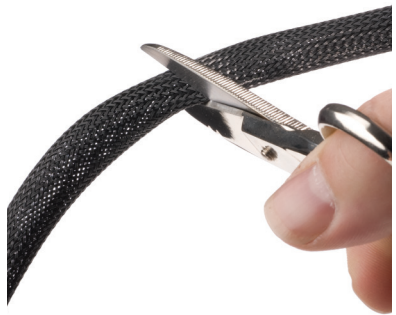
Clean Cut<sup>®</sup> cuts easily and neatly with regular scissors and maintains a fray resistant end during installation.