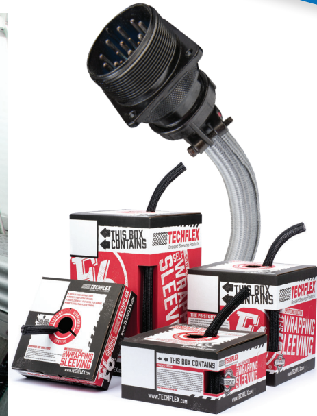
F6® is available in self-dispensing boxes.