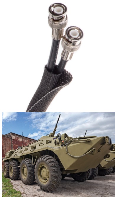
F6® Woven FR is designed to defend and contain wires in difficult environments.

The new woven construction provides superior elastic flexibility with unbeatable coverage over any harness assembly. Through a unique process, the blend of monofilament and multifilament polyester fibers are formed into a sleeving with memory that causes the sleeve to self-close, and also snap back when opened. The combination of flame retardance, ease of installation, and complete coverage makes F6® Woven FR an ideal solution for many commercial and aerospace applications.